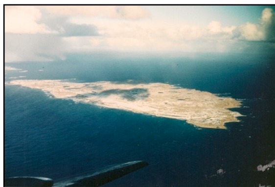
Above: Shemya, as seen from a DC-4. Left: Crew accommodations in Shemya. Below left: The venerable DC-4 on the ground in Tokyo.

NWA Flight 1 flight time to Tokyo was 33 hours. And for Phyllis and other crew members, add another 48 hours for a layover mid-flight in Shemya, an island in the Aleutians so barren and harsh the ceaseless winds blew the snow horizontally.