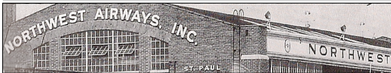
Holman Field, St. Paul, MN