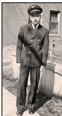
Spokane, WA, 1943