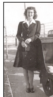
Fargo, ND 1945

Much as Woody Allen paid tribute to the great radio personalities of the 1930s and 1940s in his 1987 movie Radio Days, we pay tribute to a now vanished breed - NWA radio operators.