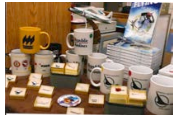
Lots of tempting memorabilia was available.