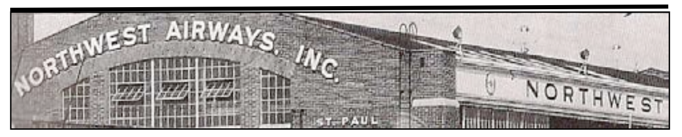
Hangar Talk . . . Stories from and about Reflections Readers