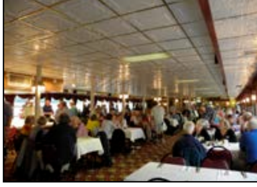
The stormy weather outside had no effect on happy diners inside the bright, floating dining room.