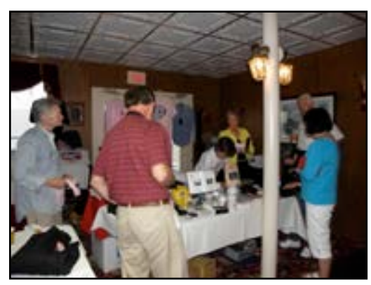
Lots of steady activity at the NWAHC table. Thank you, RNPA members and guests!