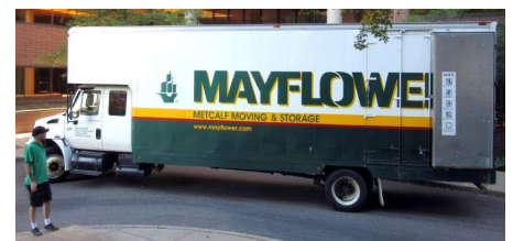
L-R: So much stuff to move! Some was going the hotel, and the rest to the new archive at Flying Cloud Airport. The crew from Metcalfe Mayflower Movers, who moved the heavy stuff (display cases) and who also moved us two years ago. We hope we never see this moving van again!

During July and August, volunteers continued to move the “small stuff” by hand, and began the arduous process of setting up displays to harmonize with our very different new space. It was like moving a household, but more complicated!