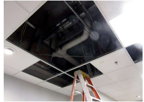
L: The Board met with consultant Pamela Zeller (fifth from left) for guidance in applying for third-party grants. R: Meanwhile, another “trickle down delay” occurred when part of the renovation work in our space required correction to pass inspection.

“M DAY”: June 23, and we had the “go ahead” to begin moving, from Two Appletree Square to the Crowne Plaza Aire at Three Appletree Square. Only about 500 feet, but with two elevators involved, a major undertaking nevertheless.