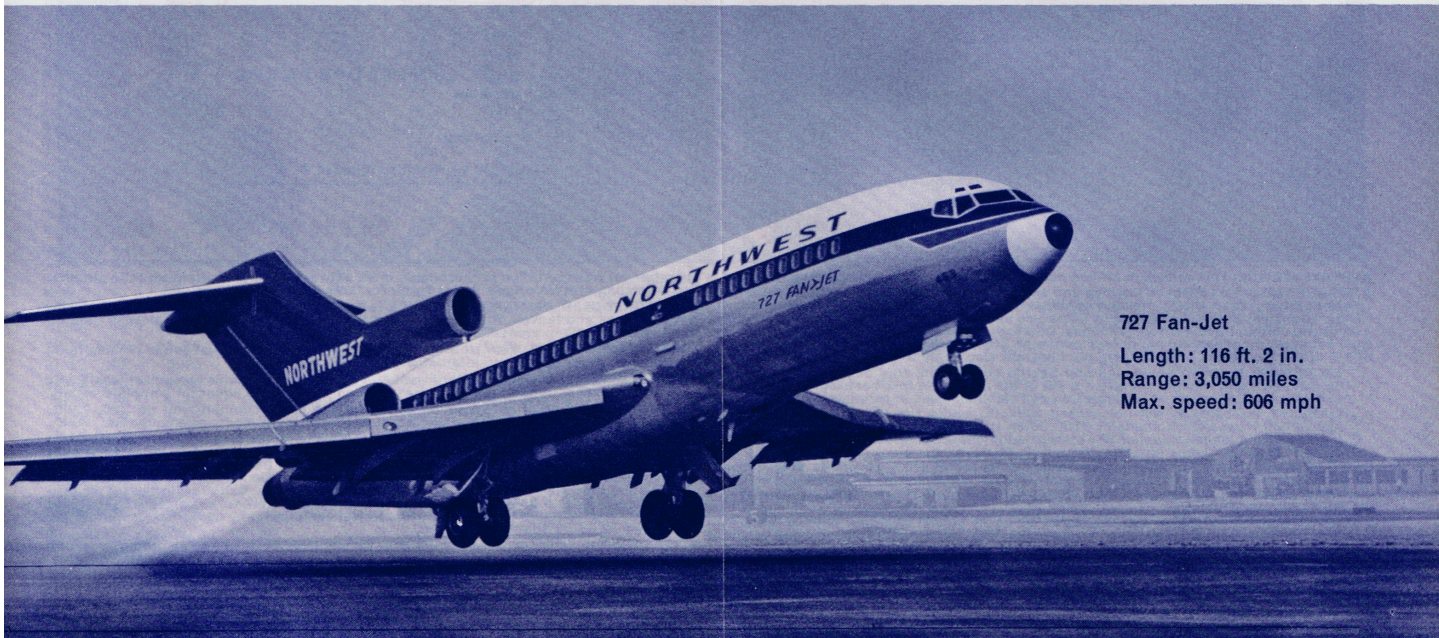
727 Fan-Jet Length: 116 ft. 2 in. Range: 3,050 miles Max. speed: 606 mph