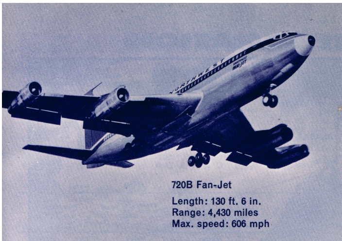
720B Fan-Jet Length: 130 ft. 6 in. Range: 4,430 miles Max. speed: 606 mph