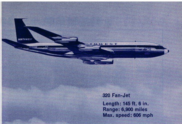
320 Fan-Jet Length: 145 ft. 6 in. Range: 6,900 miles Max. speed: 606 mph