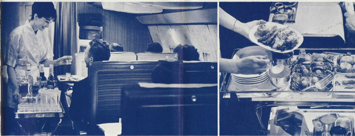
Drinks "à la cart"