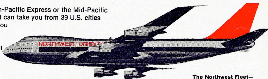
The Northwest Fleet— finest from the ground up.

Fly Northwest Orient . . . We give you half the world.