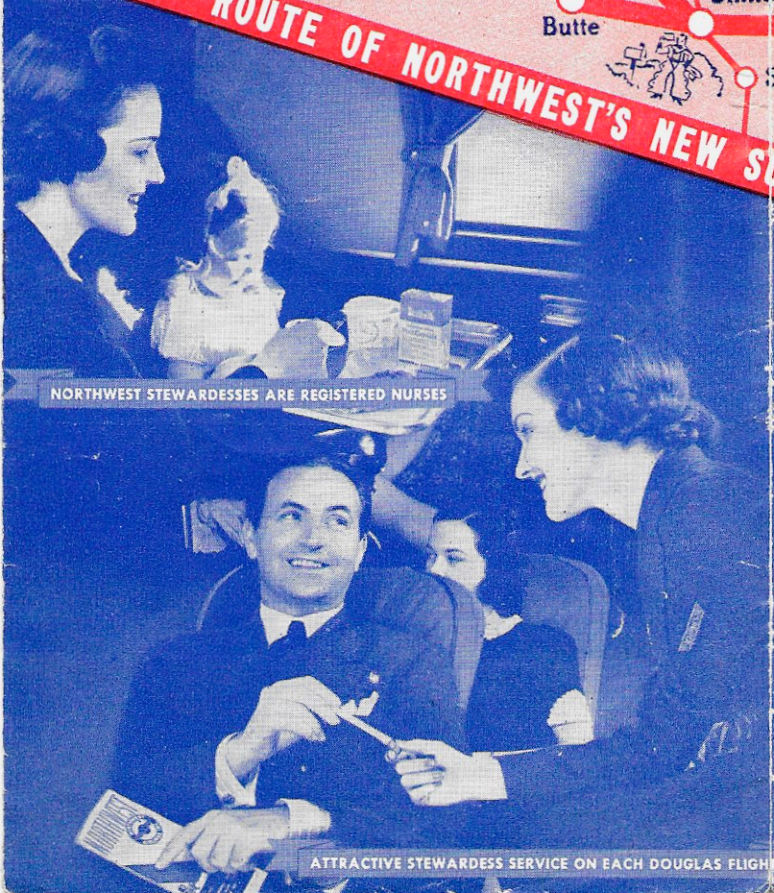
NORTHWEST STEWARDESSES ARE REGISTERED NURSES

ROUTE OF NORTHWEST'S NEW SUPER-POWERED DOUGLAS PLANES