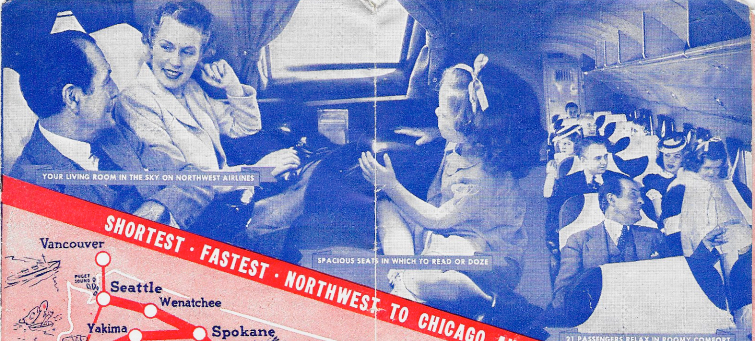
YOUR LIVING ROOM IN THE SKY ON NORTHWEST AIRLINES