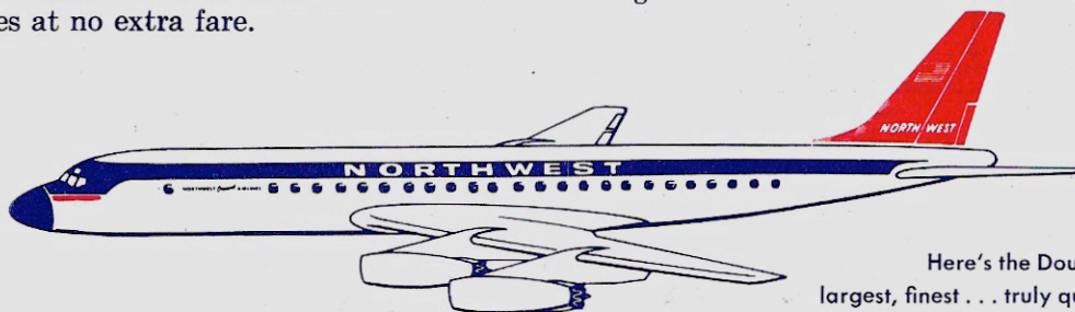
Here's the Douglas DC-8C... largest, finest... truly queen of the jets!

Two DC-8C flights from Seattle each week on Northwest's exclusive great circle route to the Orient. Depart at 11:59 PM on Tuesday or Friday. Convenient connecting Jet flights from other western coastal cities. Northwest arranges air travel to Seattle from California cities at no extra fare.