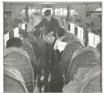
The Northwest Airways is the first Air Transport line in the United States to equip its planes with individual radio receivers for the entertainment of passengers.