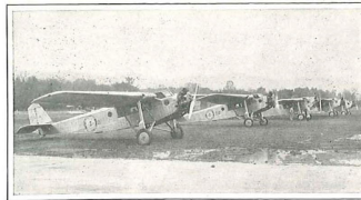
Fleet of Northwest Airways Hamilton planes "on the line" awaiting to take off.