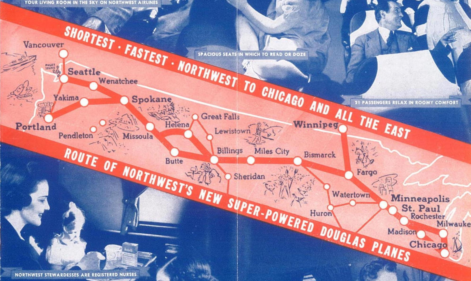
21 PASSENGERS RELAX IN ROOMY COMFORT