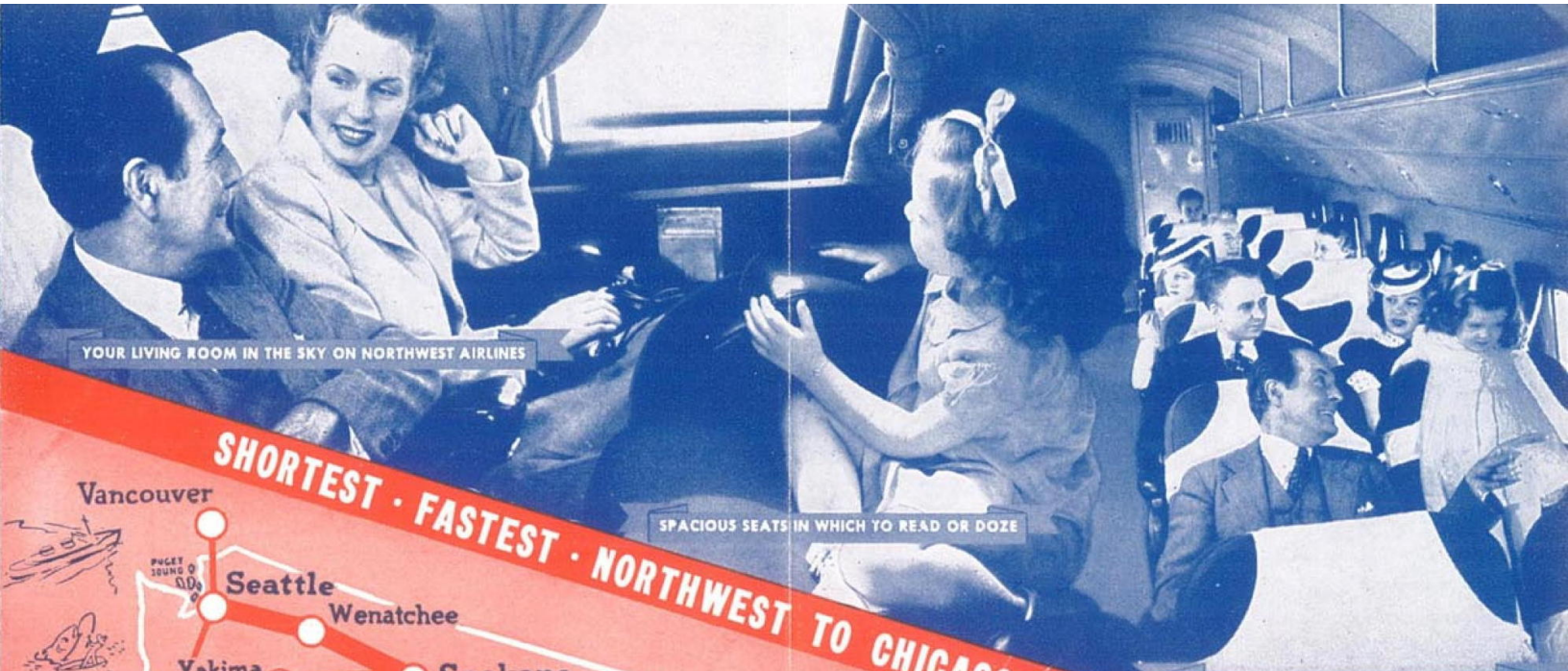
YOUR LIVING ROOM IN THE SKY ON NORTHWEST AIRLINES