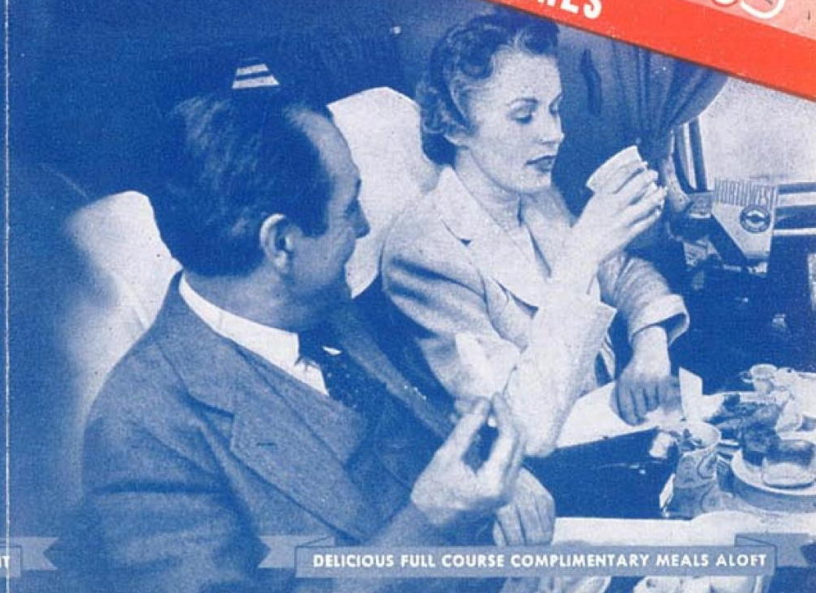
DELICIOUS FULL COURSE COMPLIMENTARY MEALS ALOFT