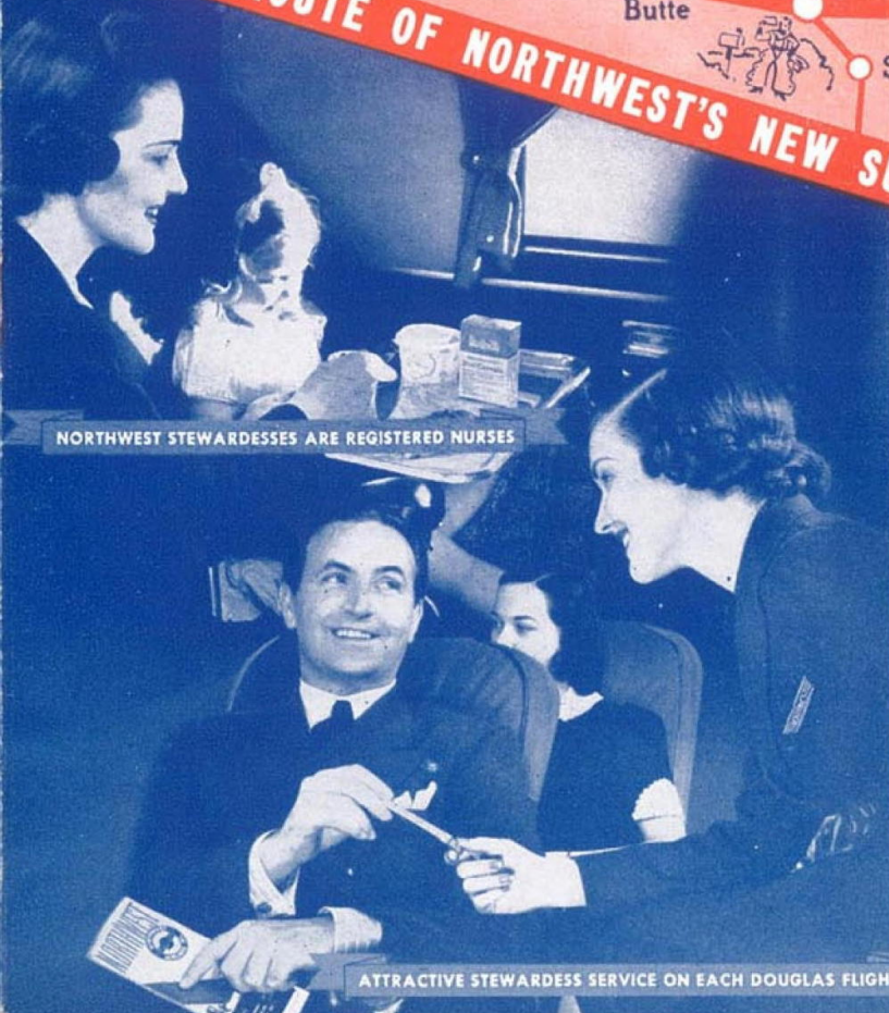
NORTHWEST STEWARDESSES ARE REGISTERED NURSES