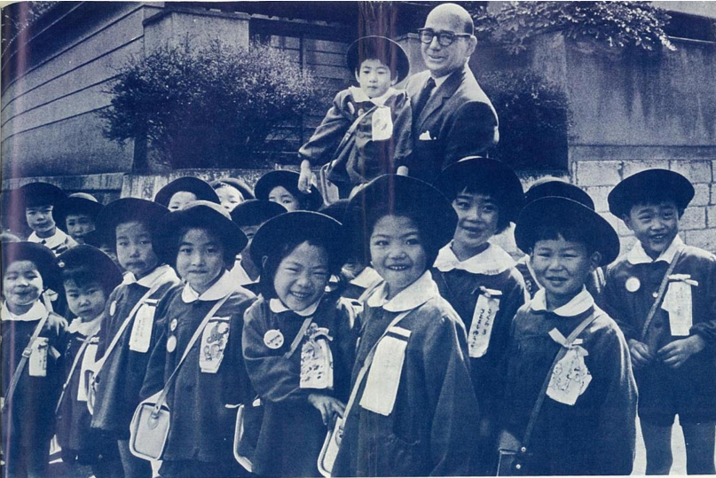
These little "Japanese dolls" are 2,000 miles closer on Northwest.