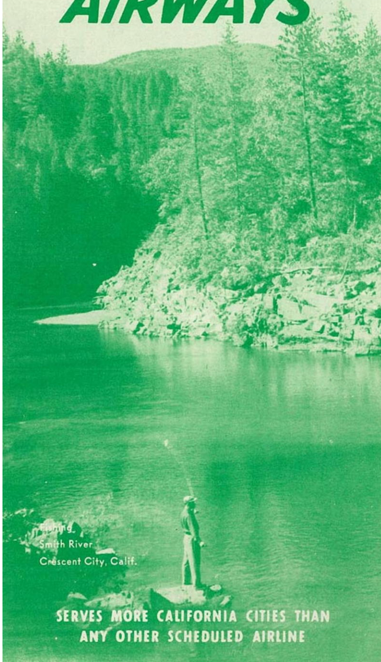
Fishing Smith River Crescent City, Calif.

SERVES MORE CALIFORNIA CITIES THAN ANY OTHER SCHEDULED AIRLINE