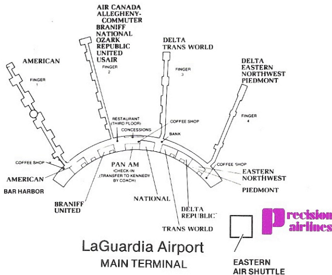
LaGuardia Airport MAIN TERMINAL

AIR FREIGHT — Carried on all flights where weight and space permits. Connections are made directly to all airlines and forwarders. Freight carried on passenger flights is limited to 100 pounds per piece. Shipments in excess of 100 pounds will be carried on cargo flights. Ask for rates and delivery service at any ticket office.