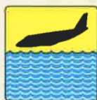
Flotation cushion Asiento flotante 浮き袋