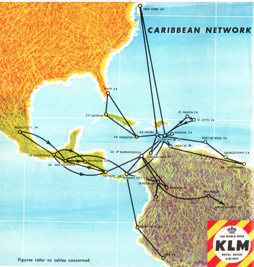
Figures refer to tables concerned