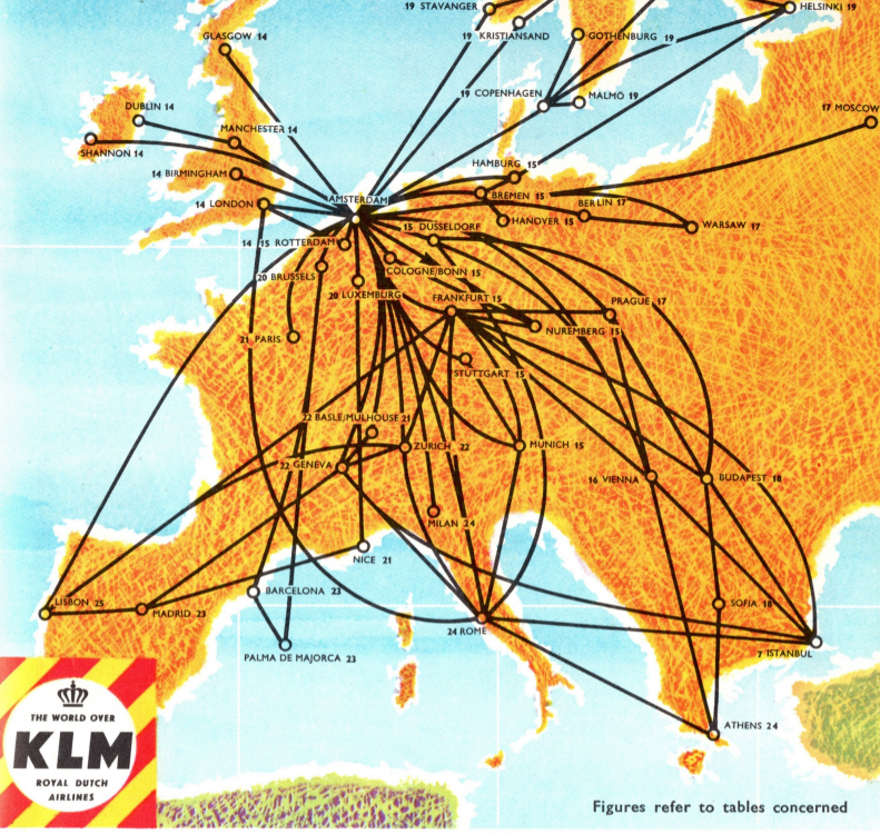
Figures refer to tables concerned