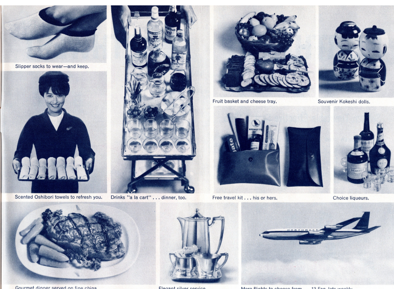
Slipper socks to wear—and keep.