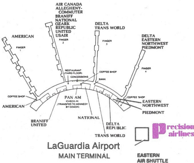
LaGuardia Airport MAIN TERMINAL

AIR FREIGHT - Carried on all flights where weight and space permits. Connections are made directly to all airlines and forwarders. Freight carried on passenger flights is limited to 100 pounds per piece. Shipments in excess of 100 pounds will be carried on cargo flights. Ask for rates and delivery service at any ticket office.