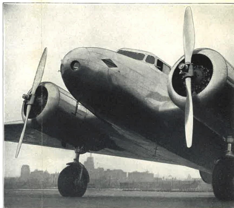
ONE OF THE FLEET of luxurious new Lockheed Electras which each month travel a distance equal to 1½ times around the world over the short, scenic route of Northwest Airlines.

SLEEP or doze in comfort by adjusting chair to a reclining position. Quiet is requested at