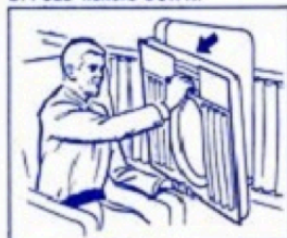
3. Windows opens INWARD.