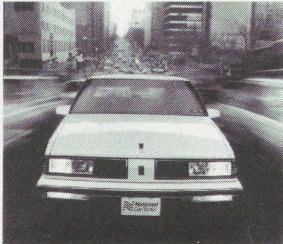
We feature GM cars like this Oldsmobile Delta 88.

From now on, one of these will be a lot simpler.