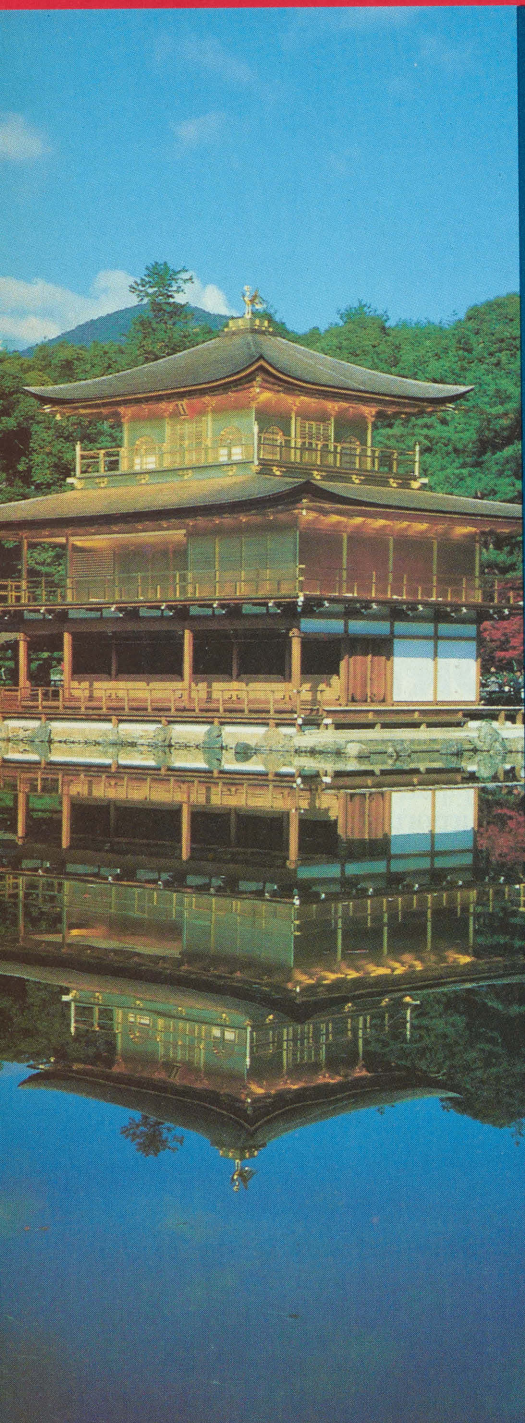
THE GOLDEN TEMPLE