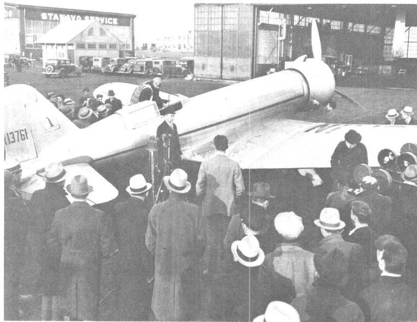
Hughes is greeted climbing out of Northrop Gamma in New York.