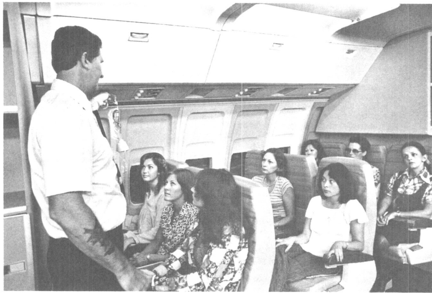
About 160 Las Vegas-based flight attendants underwent 727 training this month at Braniff Airlines' training center in Dallas. The domicile was divided into 10 groups and each group received two days of concentrated instruction, which included aircraft slide evacuation and over-water qualifying. Training will continue in Las Vegas starting Aug. 9 with instruction in customer service and crew communications.

Country Village Motor Hotel in Phoenix has a weekend package through 10/10: $39 plus tax single or double includes two nights lodging, car (daily rate and 50 miles included) and 50% off on a dinner. Children under 16 free; over 16, $2 each. Reserve one week in advance with $25 deposit. Write: 2425 S. 24th St., Phoenix 85034; (602) 273-7251.